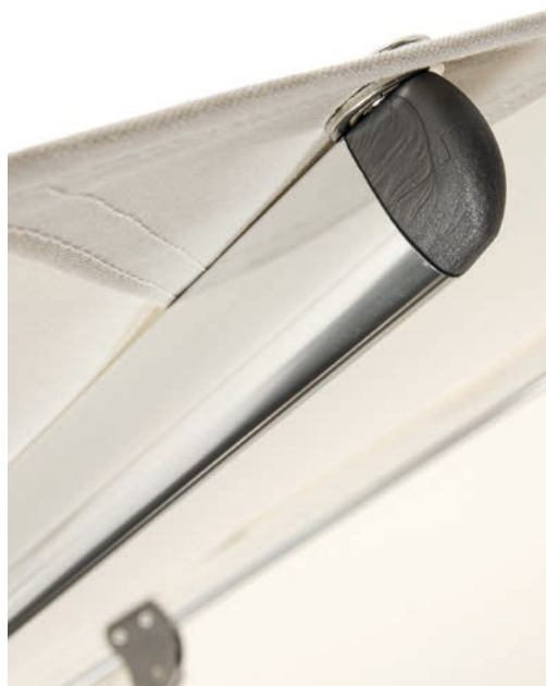
Stainless steel screws for canvas and ribs.