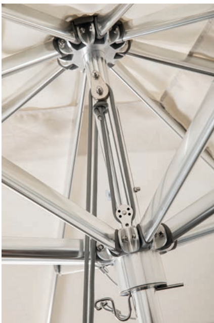
Aluminium ribs 30 x 15 mm. Thickness 1,7 mm