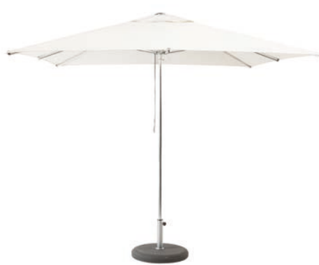
Beige U4 601 003