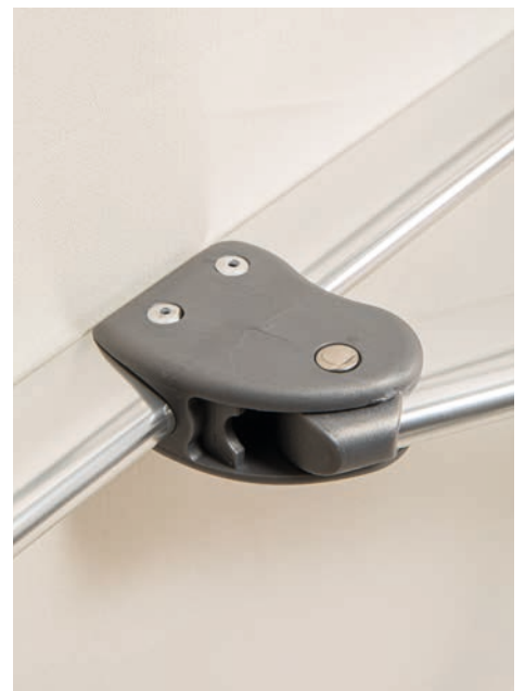
Corrosion-resistant plastic parts.