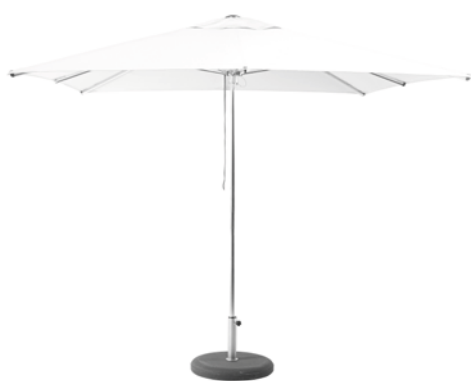
White U4 601 096

The measurements indicated are average values and can slightly vary on the product