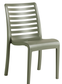
Green Forest U6 401 818

*Complies with European standards EN 581 1/2/3: product tested for safety, strength and stability for collective use.