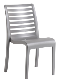
Platinum Grey U6 401 289