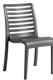
Charcoal U6 401 002