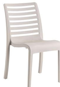
Linen U6 401 581