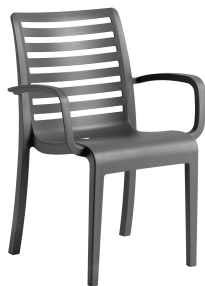
Charcoal U6 301 002