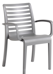
Platinum Grey U6 301 289