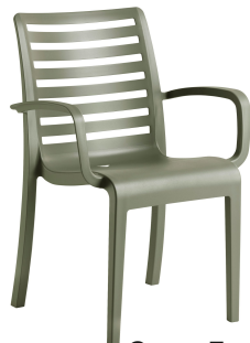
Green Forest U6 301 818