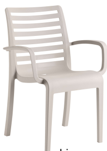
Linen U6 301 581